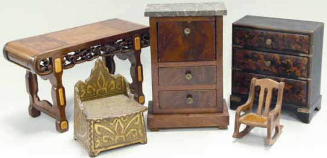
A small sampling from the collection of miniature furniture donated to LASM by Mrs. H. Payne Breazeale. The collection contains many different international styles. The piece in the center is 7.75 inches tall.